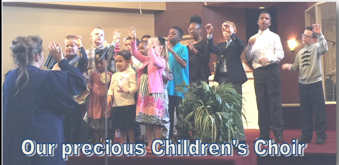
Our precious Children's Choir